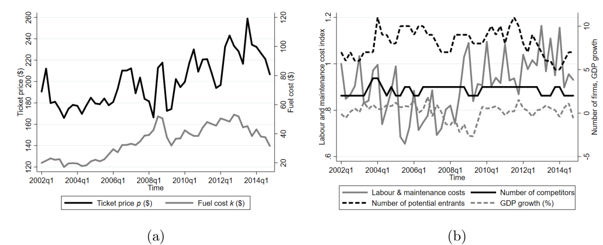
Figure 2: Time trends for Southwest’s service from Phoenix (PHX) to San Antonio (SAT), for 2002Q1-2014Q4. Panel (a) shows ticket prices and per-passenger fuel costs. Panel (b) shows the covariates.

Before presenting the full results, we illustrate our approach to estimating pass-through rates for a single route, Southwest’s service between Phoenix, Arizona (Phoenix Sky Harbor International Airport, PHX) and San Antonio, Texas (San Antonio International Airport, SAT). Table 2 gives average prices and costs for this route; the comparison with Table 1 shows that it is reasonably representative of Southwest’s portfolio of routes in our dataset. 45 The average ticket price is $200, and the average fuel cost is $33 per passenger. Figure 2(a) shows how the ticket price p_{ijt} changed with the fuel cost k_{ijt} over time. The causal component of this relationship is what we seek to estimate. Figure 2(b) shows the movement of the covariates in X_{ijt} over the period.